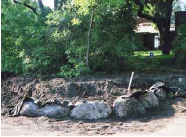
Southeast corner with boulder barrier in place.