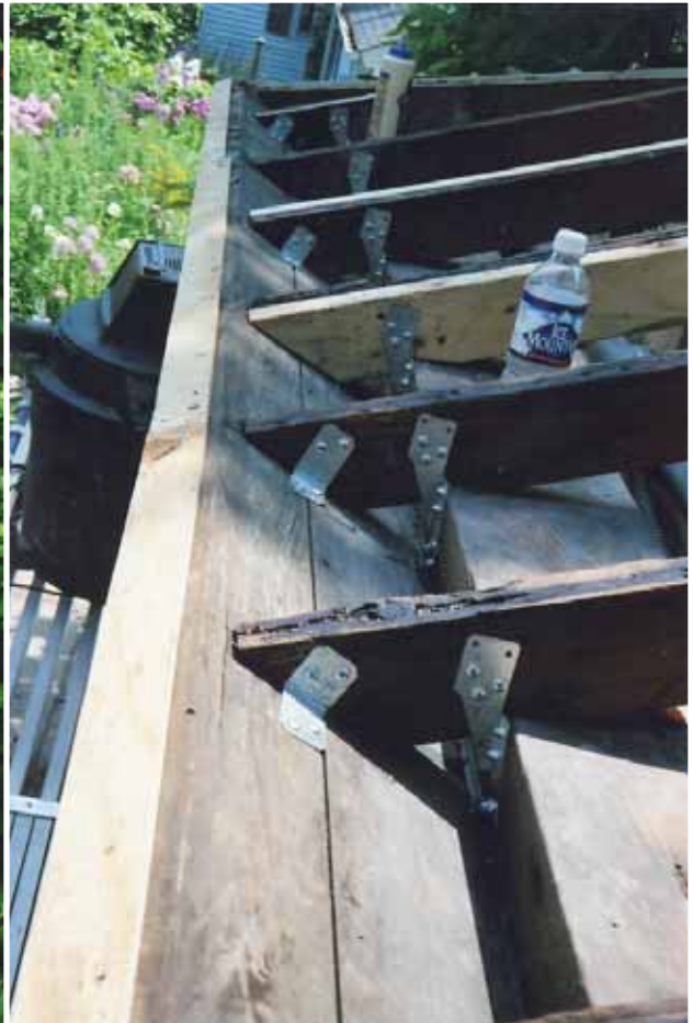
Rafter spaces are vacuumed, tails repaired and metal straps added to secure fascia to rafters.