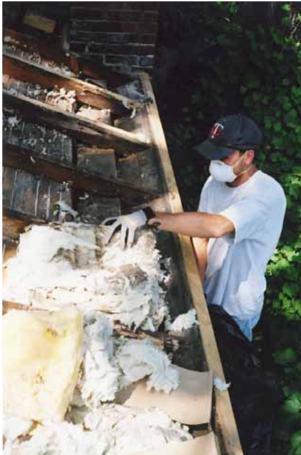
Batted insulation is removed.