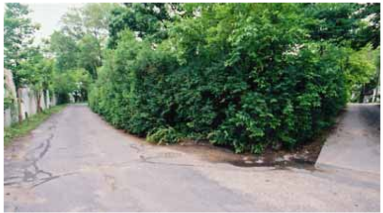
Overgrown honeysuckle bushes at southeast corner of lot prior installation of the hedge

T echny Arborvitae will grow to 20 feet tall if allowed. They are capable of making a solid and impenetrable year-round hedge. That is why they were selected to be planted in a running hedge along the front of the yard. In three years give or take, they'll start looking like the towering green wall that we are hoping to cultivate. The height will be kept at 9 - 10 feet in order to maintain the panoramic southern horizon, visible particularly during winter months. Soon the yard will be extremely private for guests and feature an accentuated sweeping vista. 📍