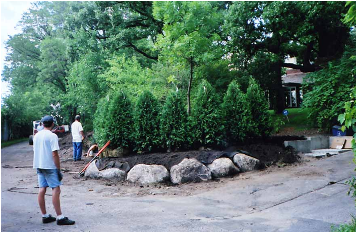
Southeast corner Arborvitaes being planted.