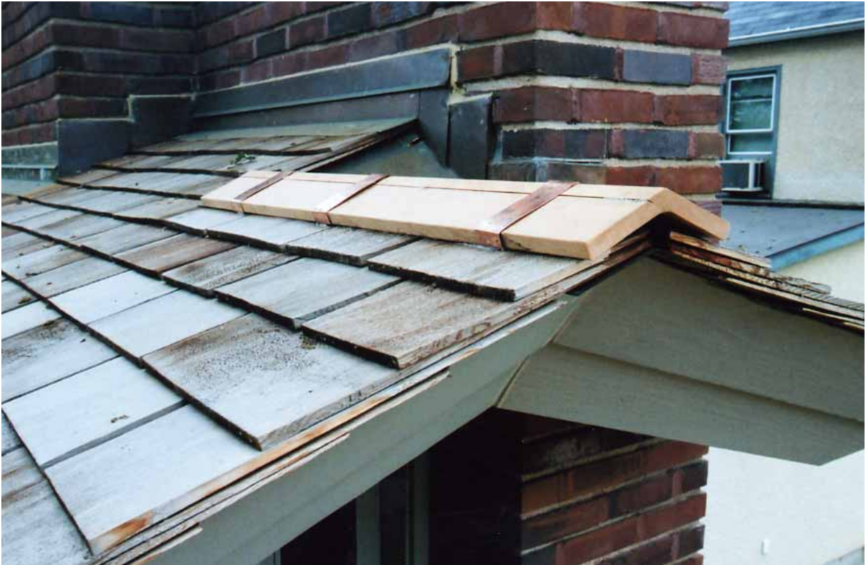
Copper straps secure the solid plank ridge boards.